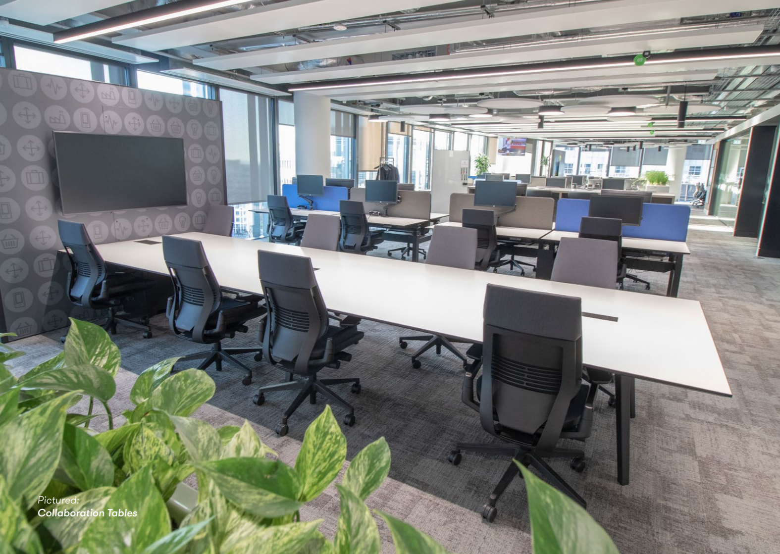
Pictured: Collaboration Tables

“The project has been a truly inspiring experience for the entire team, and I am proud of what we have collectively achieved.