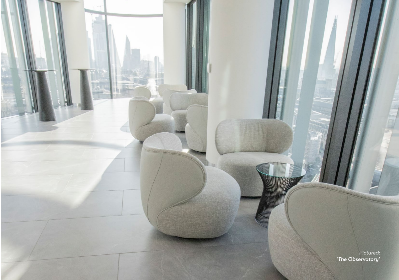
Pictured: ‘The Observatory’