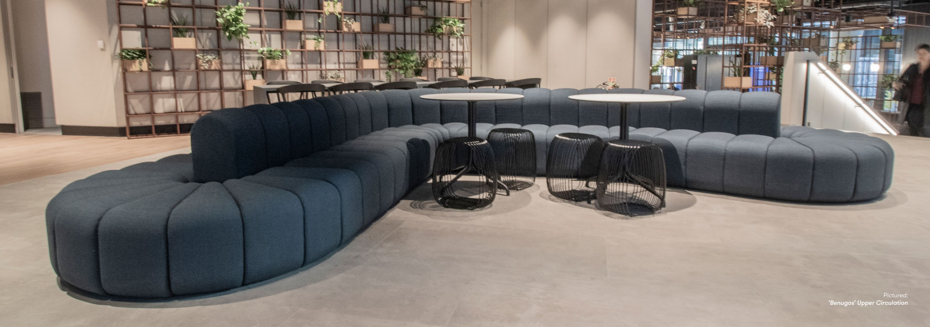
Pictured: 'Benugos' Upper Circulation