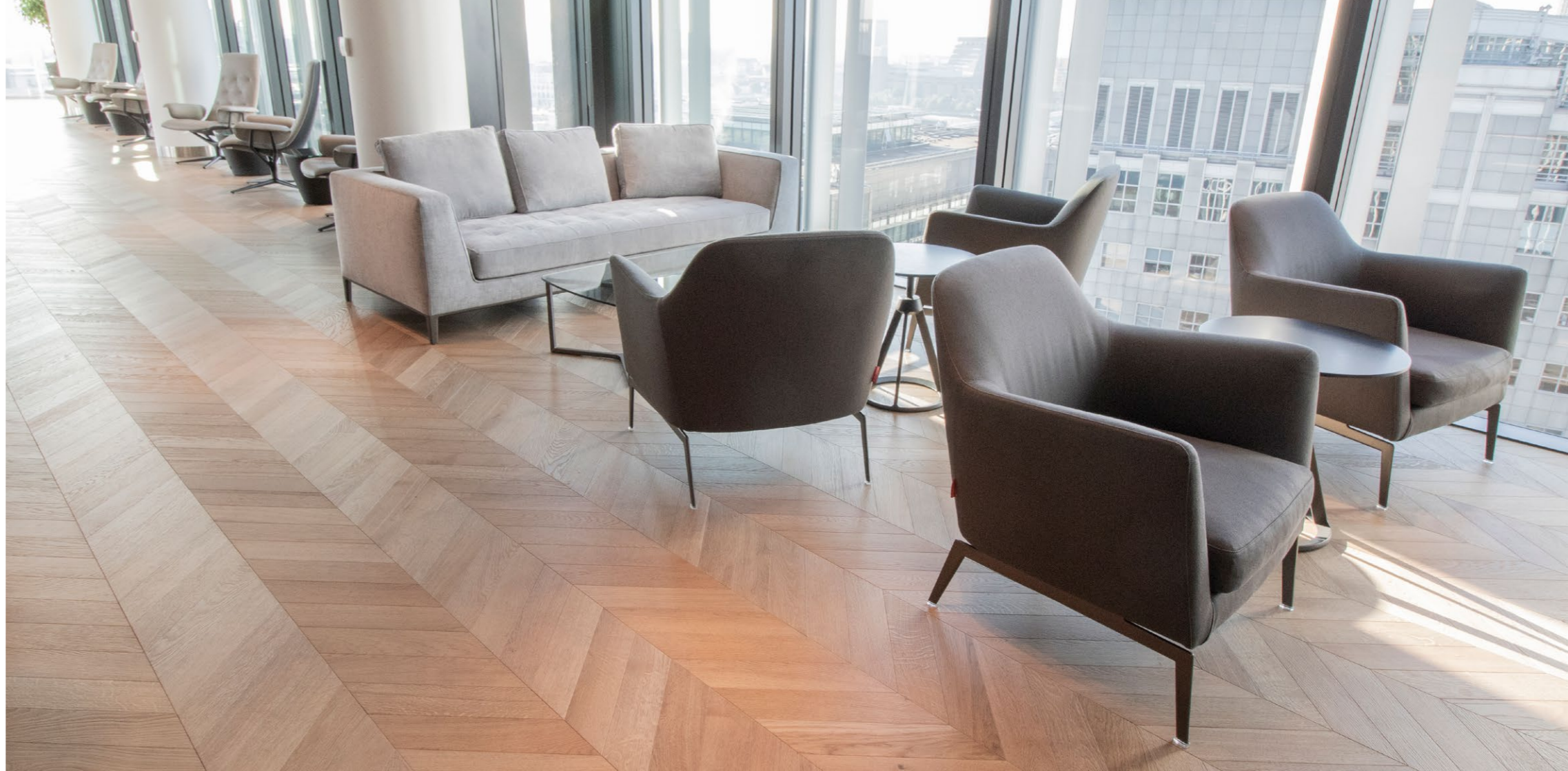
Pictured: The Terrace, and 'The Exchange'