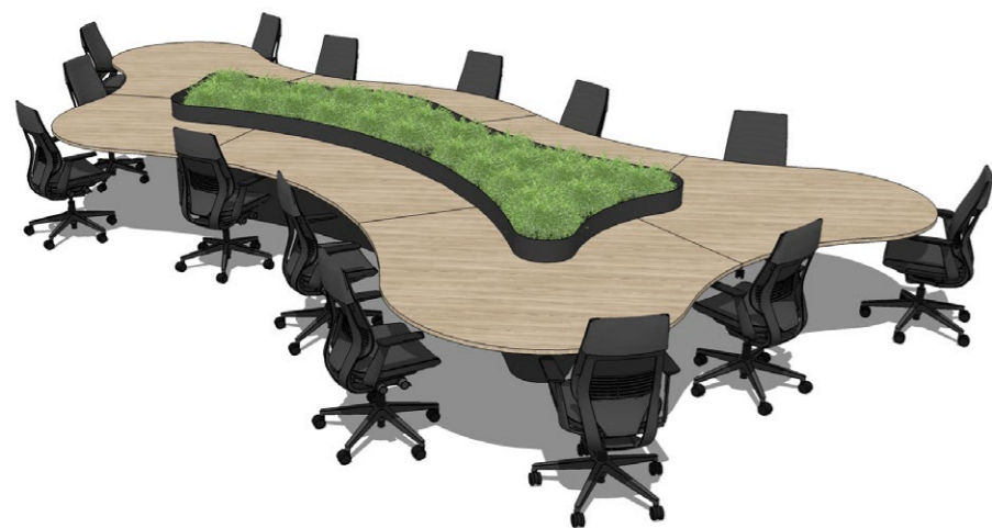
Pictured: The concept and reality of 'The Texas Table'