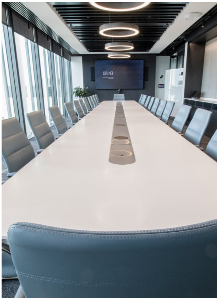
Pictured: Executive Meeting Room

The building comprises of 15 floors spread across 280,000 sq ft. 5,500 people sharing 3,500 working positions comprising of 2,000 core positions vs. 1,500 flex positions.