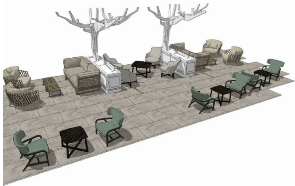
Pictured: The concept and reality of the 'The Orchard'