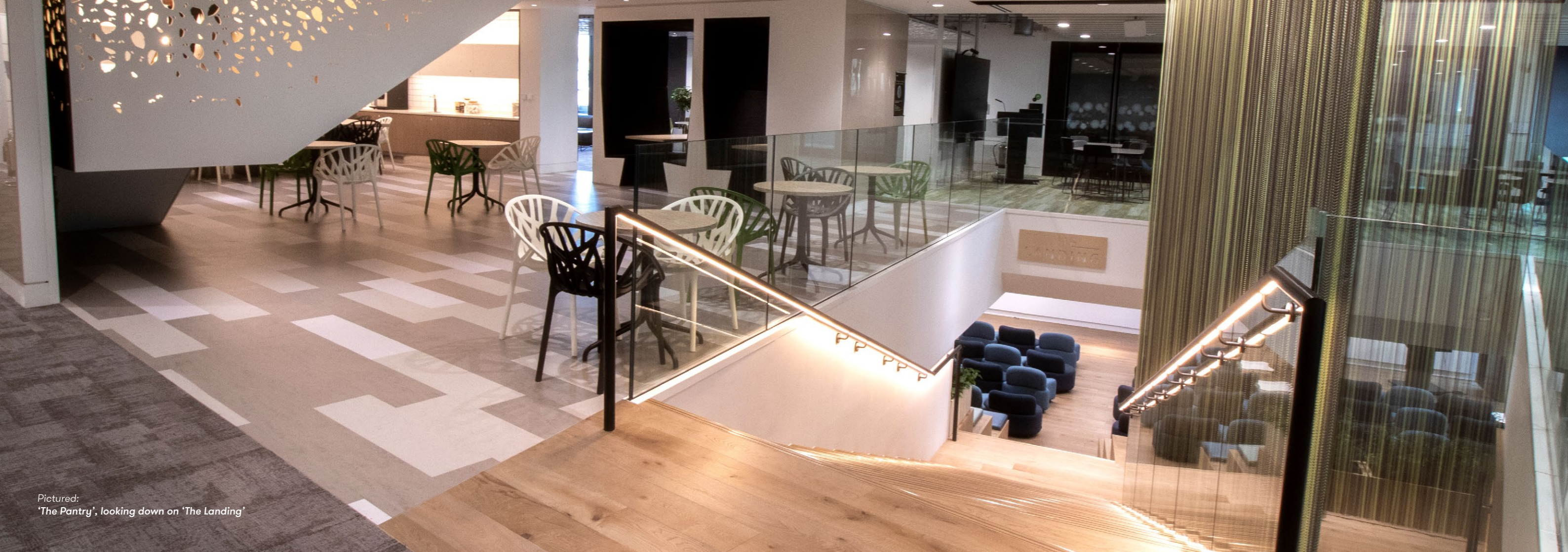
Pictured: 'The Pantry', looking down on 'The Landing'