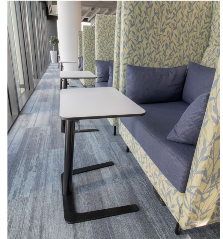
Pictured: Alternative Work Settings