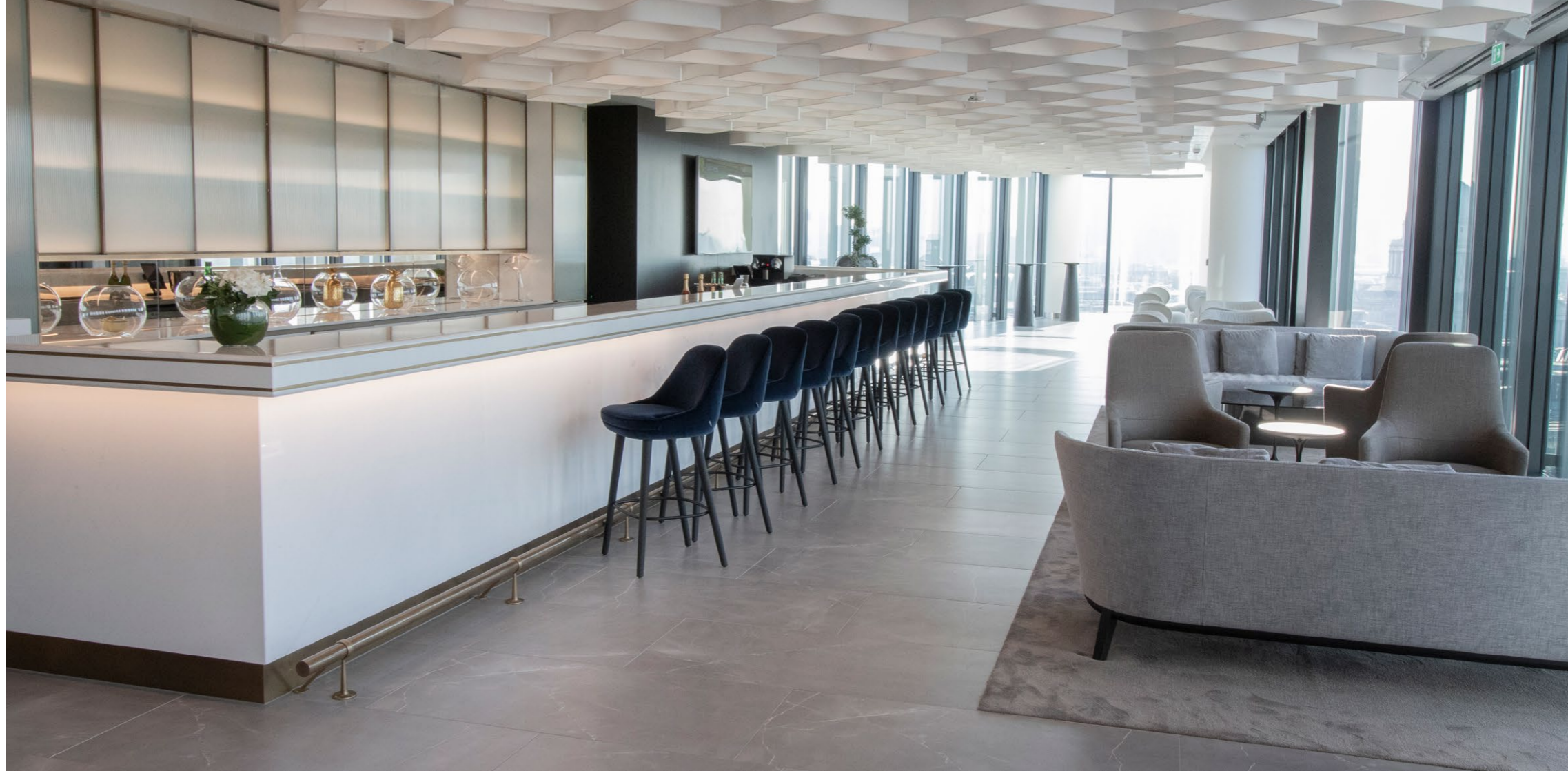
Pictured: 'The Observatory'