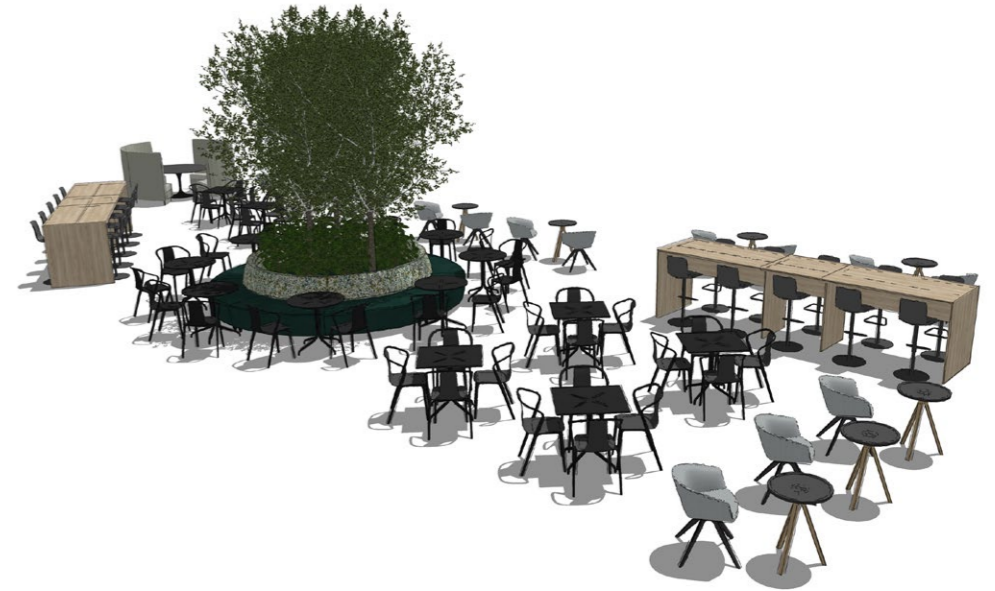
Pictured: The concept and reality of the Restaurant.