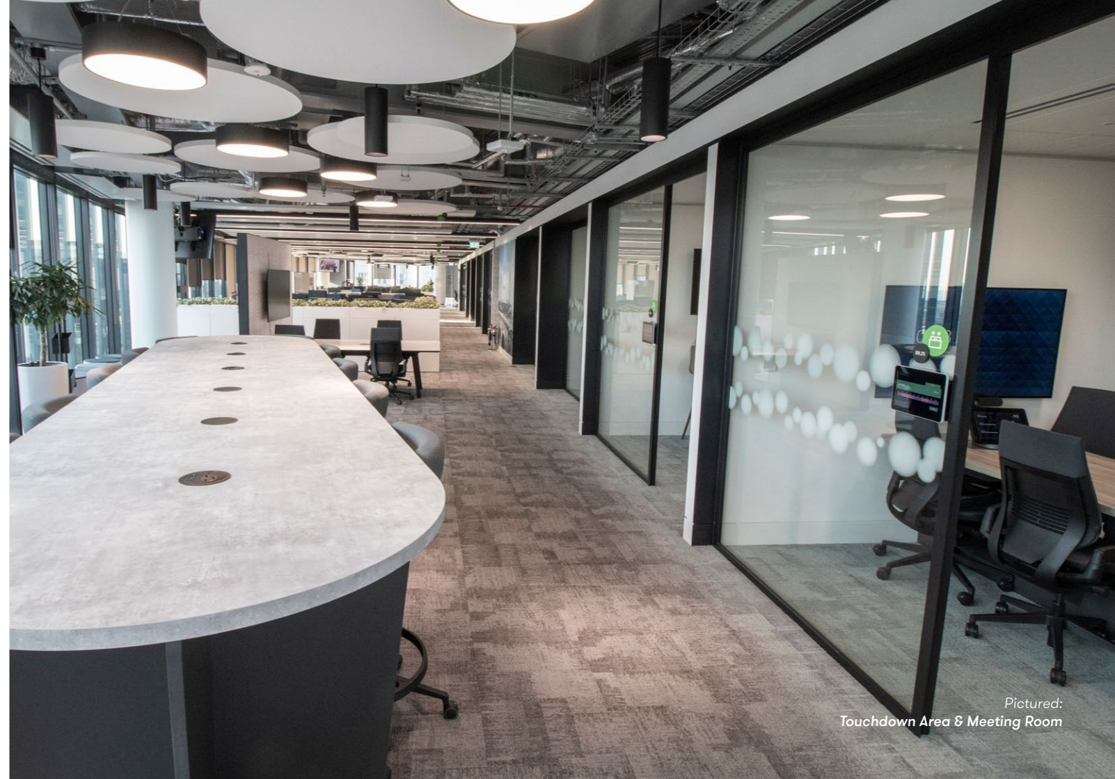
Pictured: Touchdown Area & Meeting Room