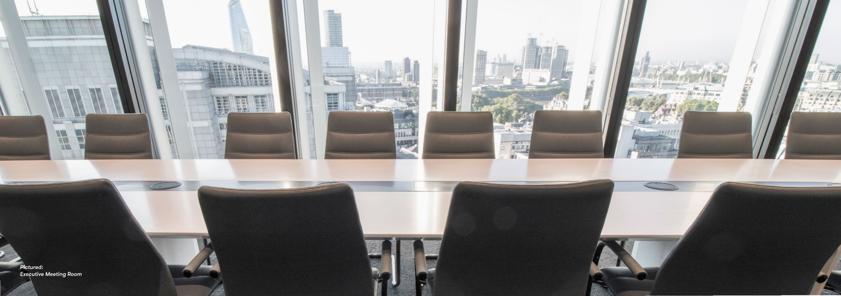
Pictured: Executive Meeting Room